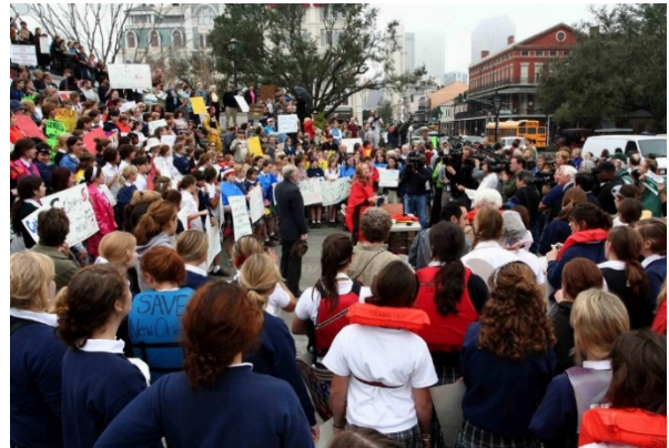
Students from Sacred High Academy high school and local community members hold a demonstration about levee repairs at Jackson Square in New Orleans, Louisiana.

Students may feel the need to participate in a demonstration or protest for a number of reasons, such as perceptions that their views are not being taken seriously or seriously enough; being called to action after exposure to information, messages and images from corollary media coverage following emergency events 3 ; or based on their own personal responses to and opinions regarding social and political trends or events. In some scenarios, students may feel compelled to plan and lead their own protest or demonstration in the school environment. In these situations, schools may want to consider the following: